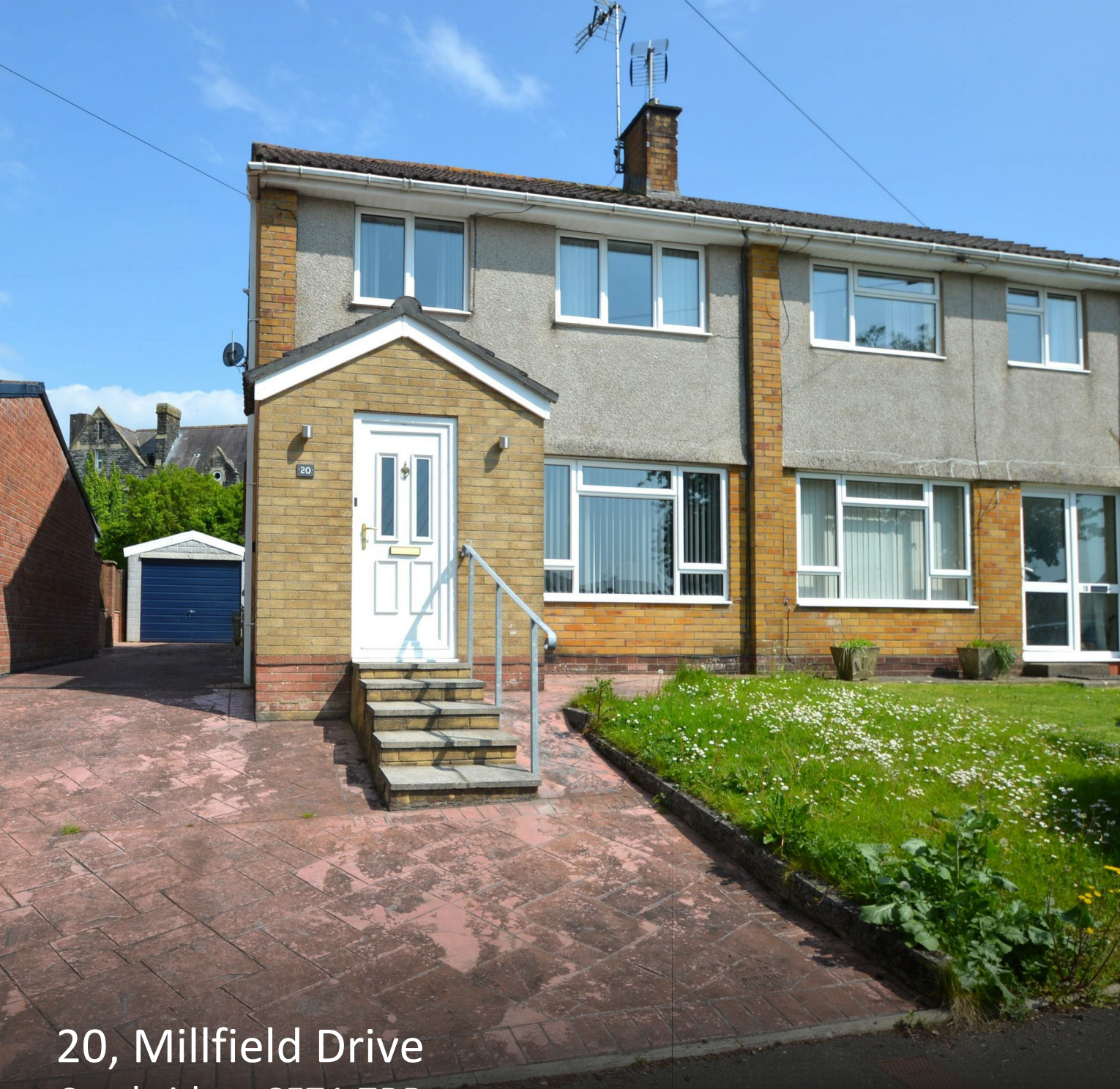
20, Millfield Drive Cowbridge, CF71 7BR